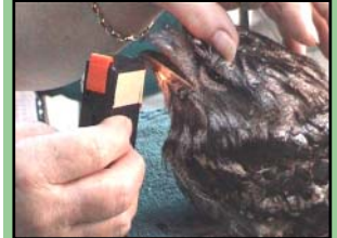
New Admission - Tawny Frogmouth