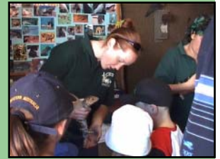
Kanyana at the Perth Royal Agricultural Show 2003