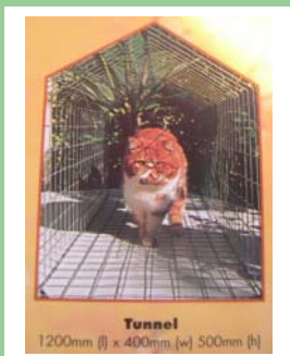
Catmax saved my sanity!